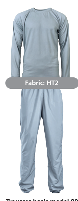
Trousers basic model 90 Art. no. 7790LAG1