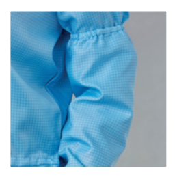
Sleeve protector basic model 70 Art. no. 1770LAG1