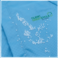
Polyester fibre made from PET chips