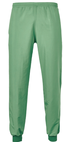
Pullover and trousers in Light-Tech

DASTAT-REC combined with Light-Tech REC and HT-REC also meet the requirements recycled PET bottles. Extensive studies and tests at independent internationally recognised textile research institutes prove that DASTAT-REC combined with Light-Tech REC and HT-REC also meet the requirements of critical processes in cleanrooms. During the studies – as with all textiles used by Dastex – special emphasis was placed on taking ageing-related effects into account.