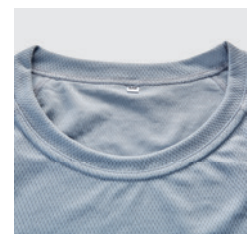
T-shirt in HT-REC