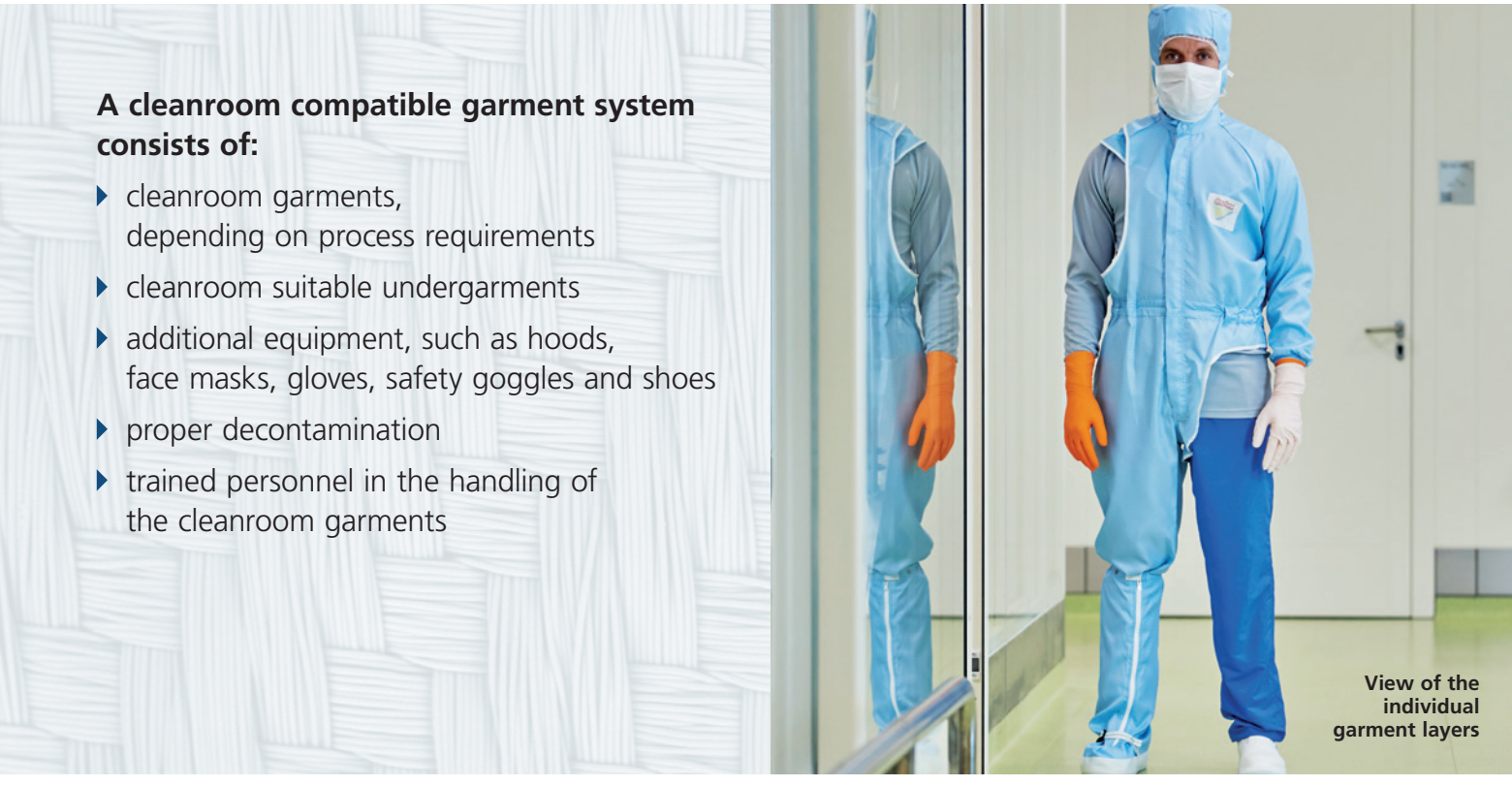
Typical garment system for use in A/B areas

It is common knowledge that humans are one of the biggest sources of contamination in a cleanroom process. It is therefore all the more important to match the decisive filter, the cleanroom garment, to the respective requirements.